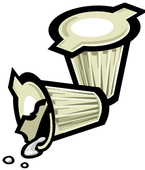
crema de leche